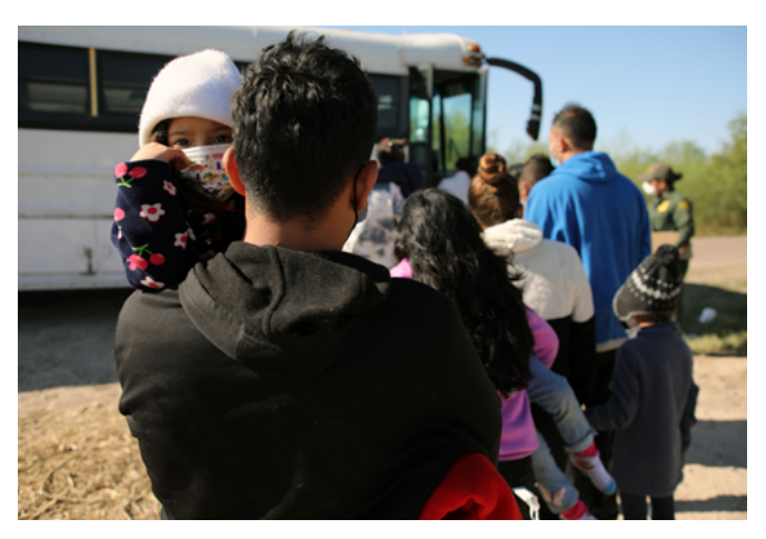
La Joya, TX, USA - Nov. 16, 2021: Asylum seekers waiting to board a bus to a Border Patrol processing center. Vic Hinterlang

These are lesser forms of protection than asylum because they do not put the individual on a path to permanent resident status (and potentially citizenship) in the United States. They also do not allow someone to apply for their family members to join them in the U.S. (although the regulation does say that in cases in which a family would be separated because one of them qualifies for withholding but others do not, the head of the family can receive asylum so that the whole family can be covered). And they may be revoked at the discretion of a U.S. official if circumstances change in their home country. However, they do protect individuals from deportation and usually allow them to work in the United States legally while they remain here.